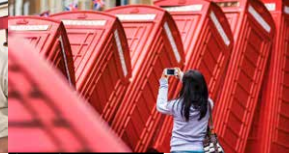
'Out of Order' sculpture

Experience the best of London without the stress of city living via Kingston upon Thames