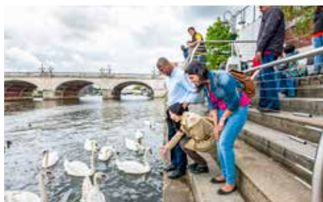
Kingston Dance Society

With 30 sports clubs on campus, you have a great opportunity to try something new. Clubs include badminton, football, rugby, cricket, snow sports, fencing and karting.