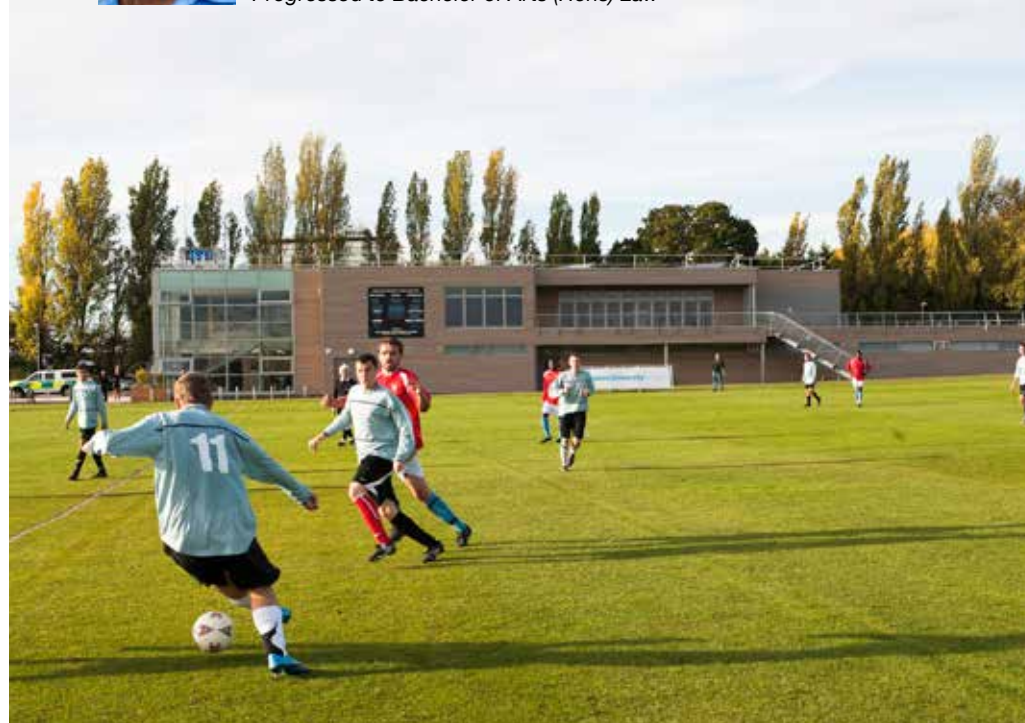
Tolworth Court sports ground