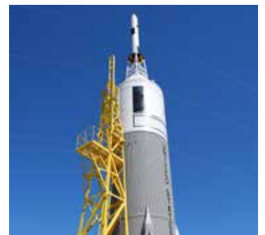
Clockwise from top: San Antonio Riverwalk, Bullock Texas State History Museum, Houston Space Center, Dallas Skyscrapers.