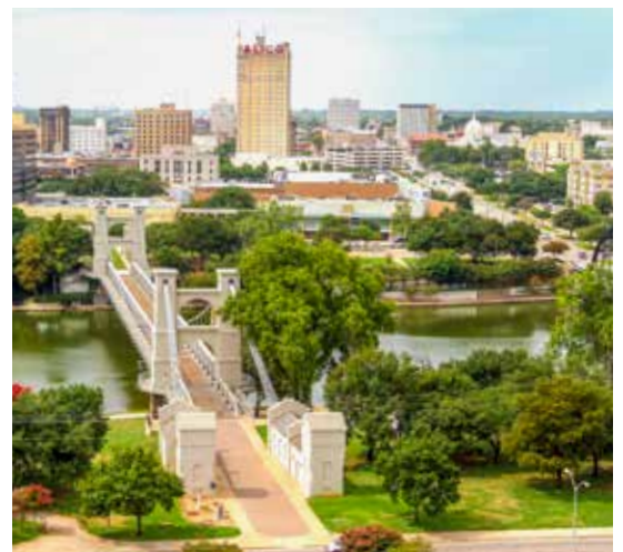
The campus is located between two bridges crossing the Brazos river.