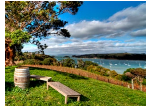
The Goldie Vineyard on Waiheke Island is a University of Auckland teaching facility for the Wine Science programme.