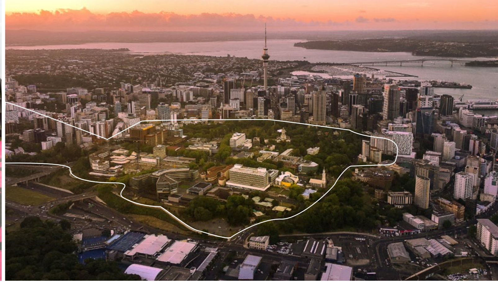
The University of Auckland City Campus