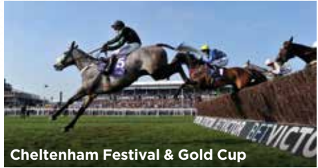
Cheltenham Festival & Gold Cup