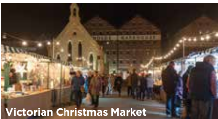
Victorian Christmas Market