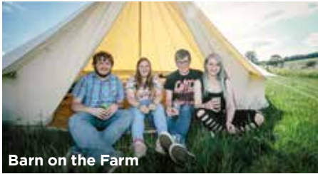
Barn on the Farm