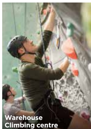
Warehouse Climbing centre