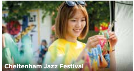
Cheltenham Jazz Festival