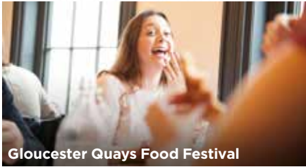
Gloucester Quays Food Festival