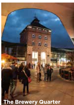
The Brewery Quarter