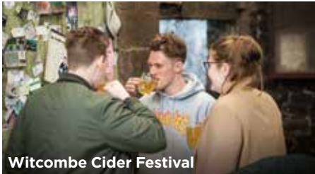
Witcombe Cider Festival