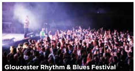
Gloucester Rhythm & Blues Festival