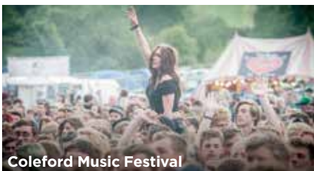
Coleford Music Festival