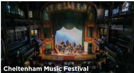
Cheltenham Music Festival