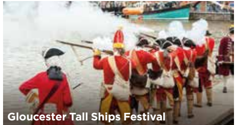
Gloucester Tall Ships Festival