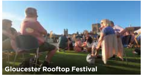
Gloucester Rooftop Festival