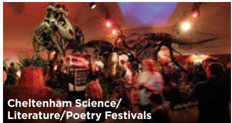
Cheltenham Science/ Literature/Poetry Festivals