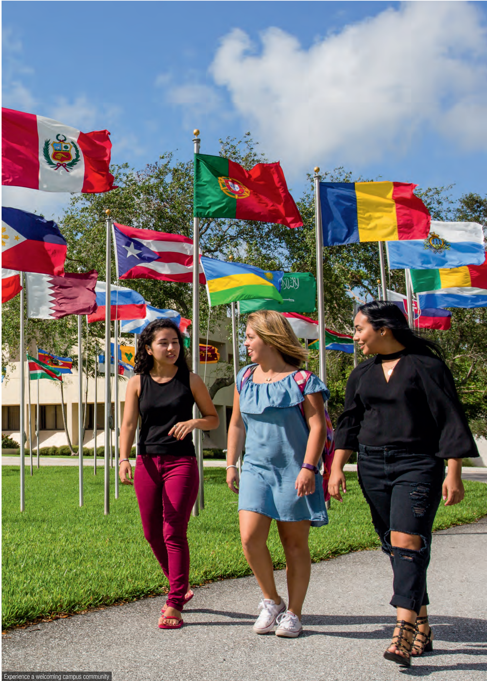
Experience a welcoming campus community