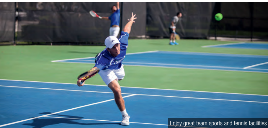
Enjoy great team sports and tennis facilities