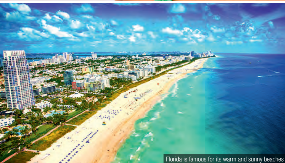
Florida is famous for its warm and sunny beaches