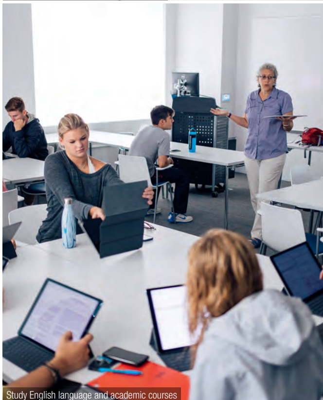
Study English language and academic courses

The International Year program is up to a one-year credit-bearing pathway program, preparing you for success as you begin your undergraduate studies at Lynn.