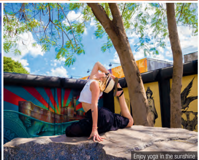
Enjoy yoga in the sunshine