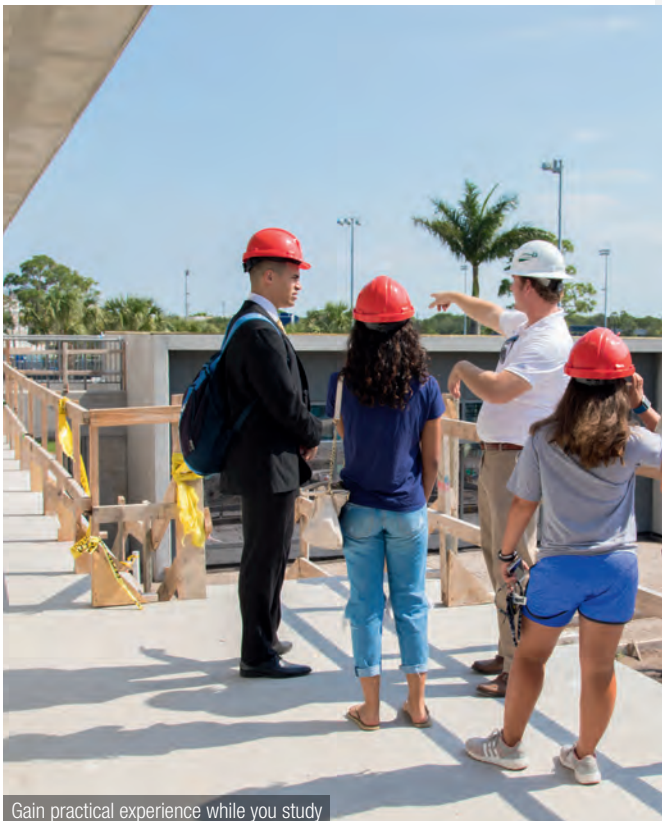
Gain practical experience while you study

The Pre-Master's Program is a two-semester pathway that prepares you for your master's degree at Lynn.