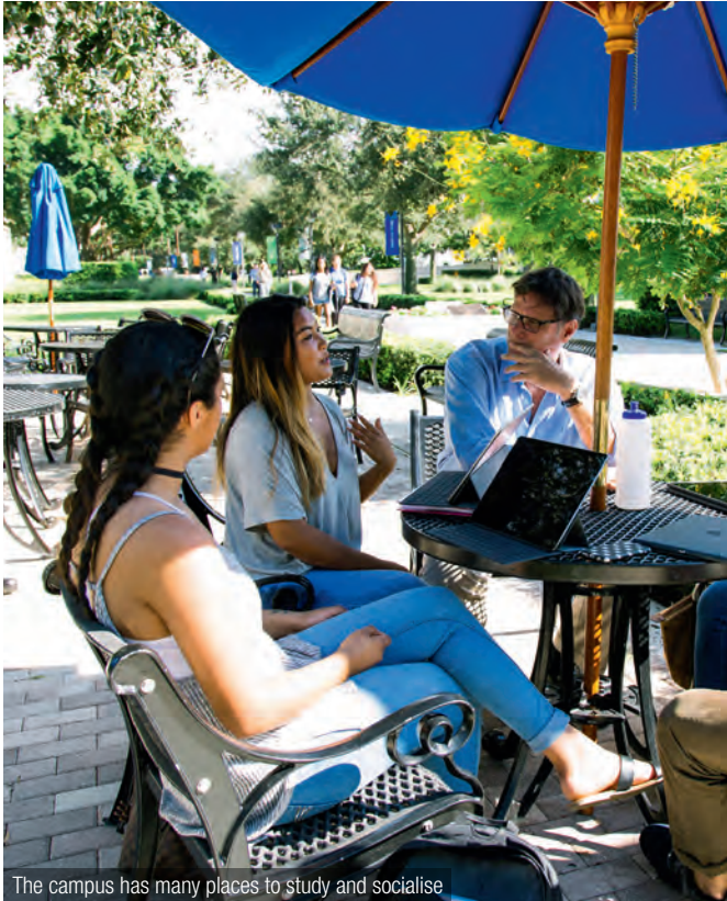
The campus has many places to study and socialise