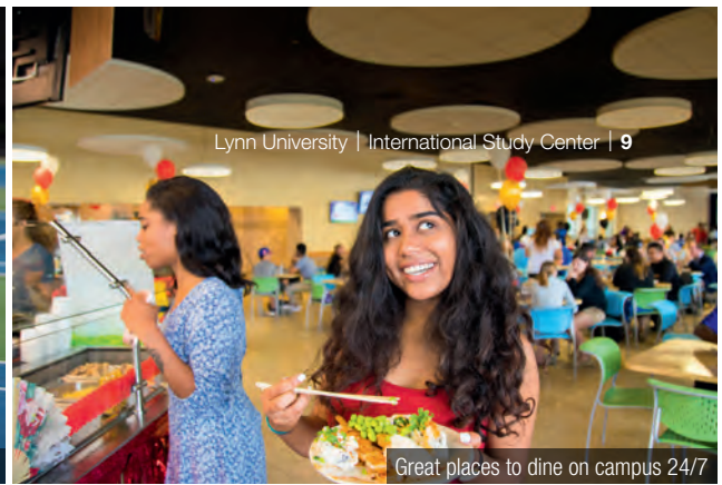
Great places to dine on campus 24/7