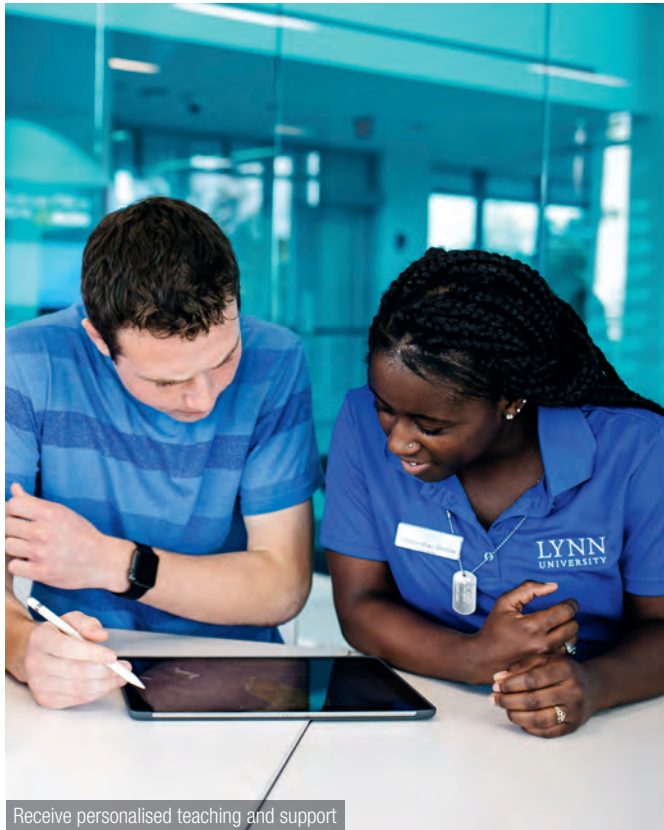
Receive personalised teaching and support