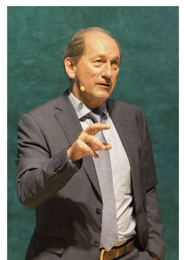
Paul Bulcke Chairman of Nestlé