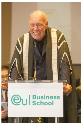
Jean-Claude Biver President of LVMH Watch Division, Chairman of Hublot, Chairman of Zenith Watches and CEO of TAG Heuer