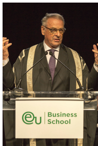
Adolf Ogi Former President of Switzerland

EU Business School regularly invites some of the world's most eminent leaders to share their expertise with students.