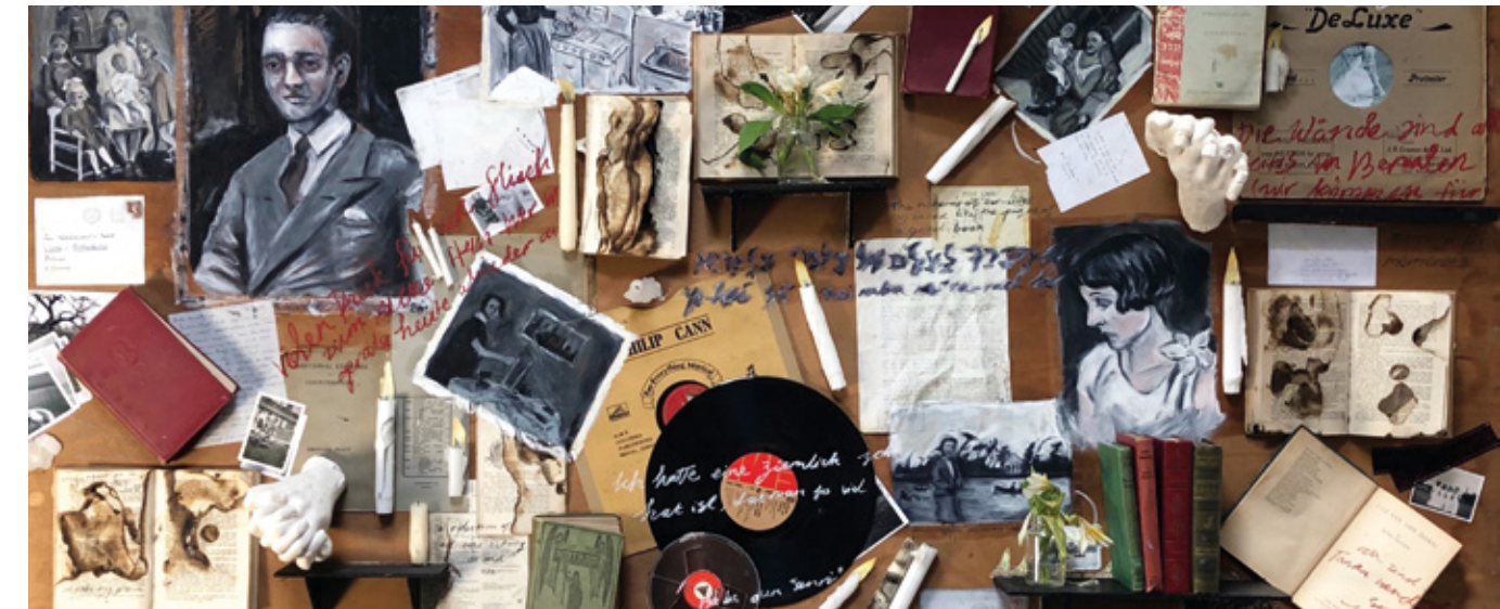
Gigi Grunberg, Portfolio Course Photography collage