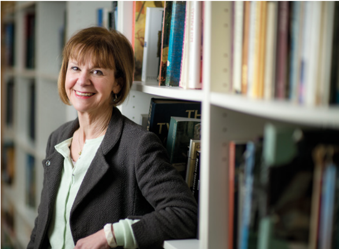
Candida Cave, Principal Fine Arts College

Visit London Art Galleries and European cities.