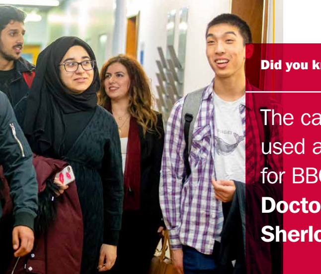
RDIFF IS ONE OF THE MOST MULTICULTURAL CITIES IN THE UK

BEAUTIFUL CARDIFF CASTLE, IN THE CENTRE OF THE CITY