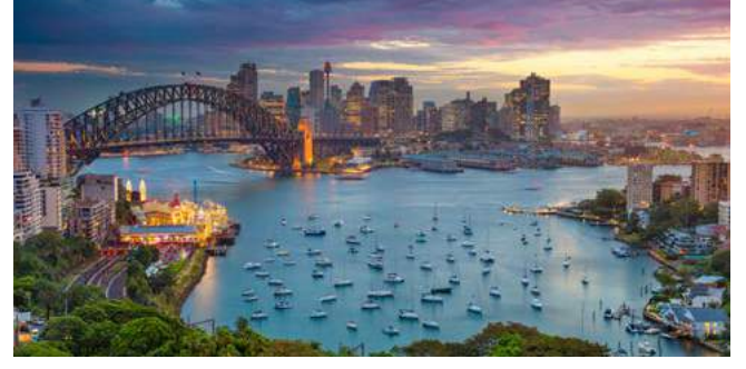
See world-famous iconic landmarks along Sydney's Harbour.