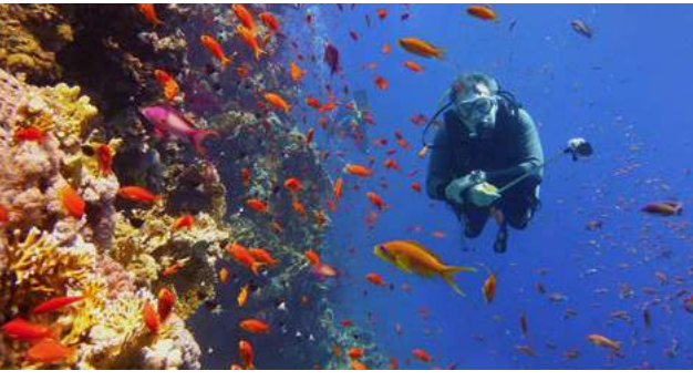
Go beyond the surface and snorkel amongst the beauty of the Great Barrier Reef.