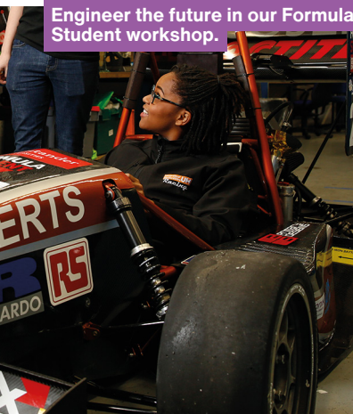
Engineer the future in our Formula Student workshop.

Study your way: online, on campus, in your own time. As well as subject-specific facilities, you'll have access to two modern, spacious 24/7 libraries with computing facilities and study spaces.