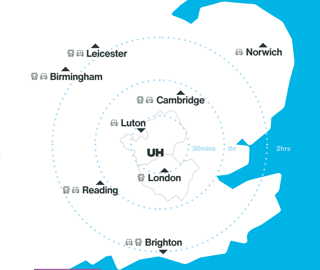
College Lane Campus