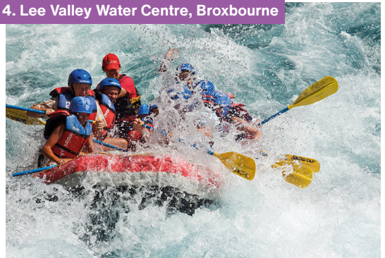
4. Lee Valley Water Centre, Broxbourne