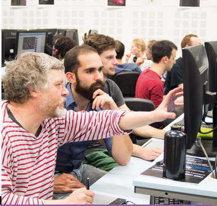
Create new worlds in our animation suites.