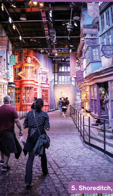
3. Warner Bros. Studio Tour London – The Making of Harry Potter